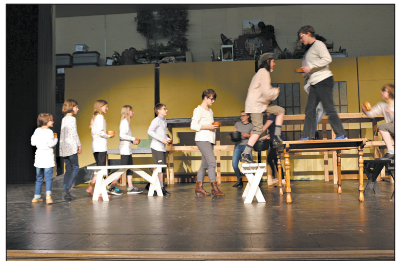
Students from Manitou Springs Middle and Elementary schools will be included as cast members in this year's production.

The high school band and orchestra students are contributing by providing the music.